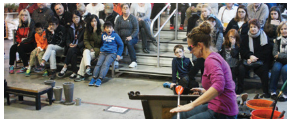
m orean glass studio