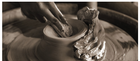
m orean center FOR CLAY